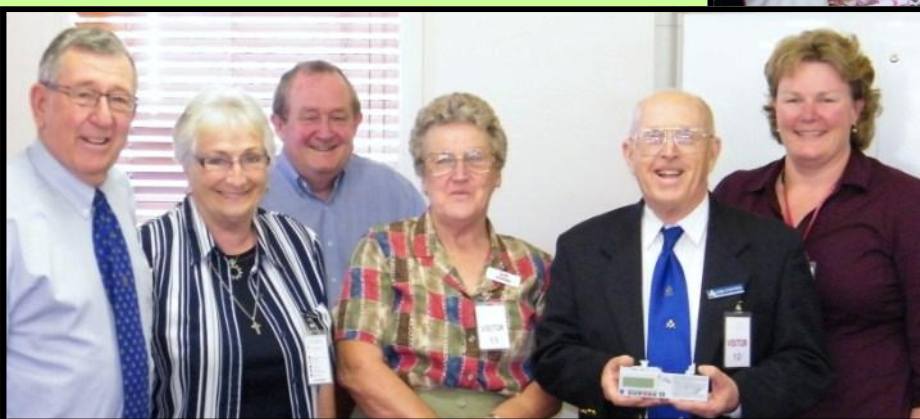
Darling Downs Freemasons

Toowoomba Hospice Association 57b O'Quinn St PO Box 6463 Toowoomba West Qld 4350