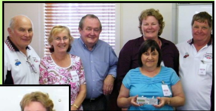
Toowoomba Mini Owners Club