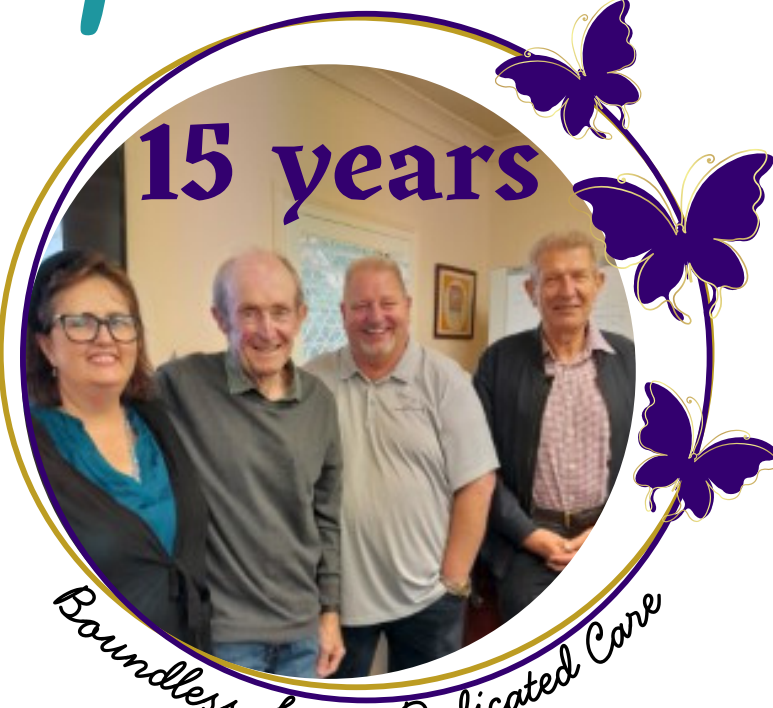
Boundless Love, Dedicated Care